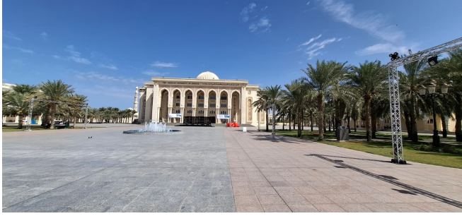
AUS Main Campus, University City, Sharjah