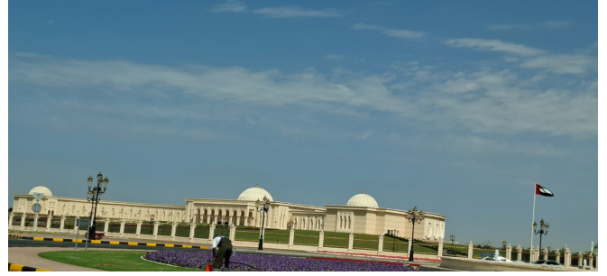
Campus grounds with UAE flag