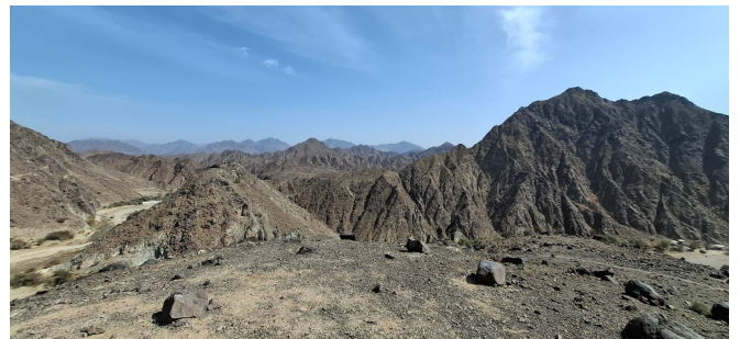
Hajar Mountains — scenic excursion opportunity