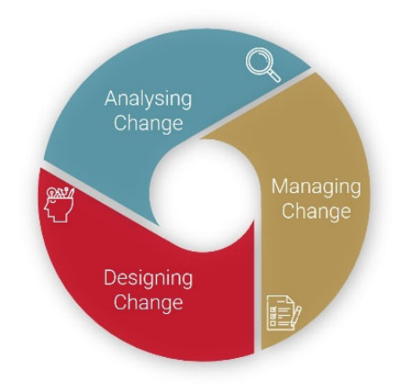
Figure 4: Structure of the MSc Tourism & Change curriculum

Students analyse natural, socio-cultural, political, economic and technological changes, evaluate the consequences of change for the tourism industry and apply strategic foresight tools (such as scenario development) to help tourism companies and organisations to become more adaptable and future-focused. On the one hand, they learn how to overcome change